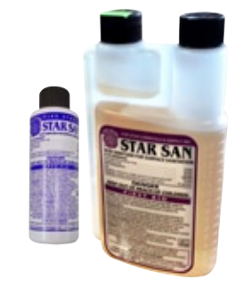
Star San Acid Sanitizer