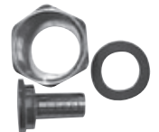
Stainless Steel Faucet Shank Adaptor with Hex Nut Adaptors, Washer and Barb Insert