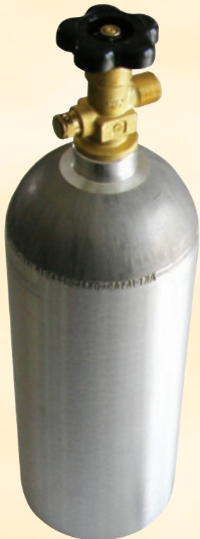
5 / 10 / 20 lb tanks available