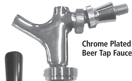
Chrome Plated Beer Tap Faucet