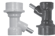
Stainless Steel Ball Lock Connectors