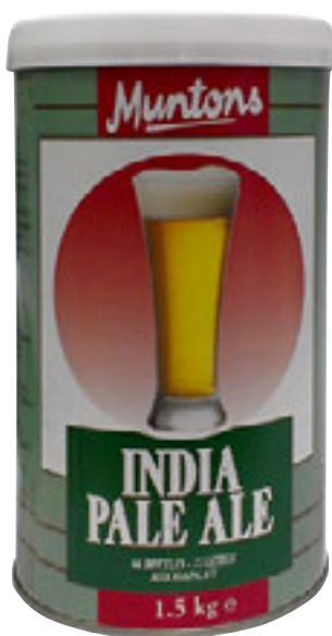
MUNTIONS India Pale Ale