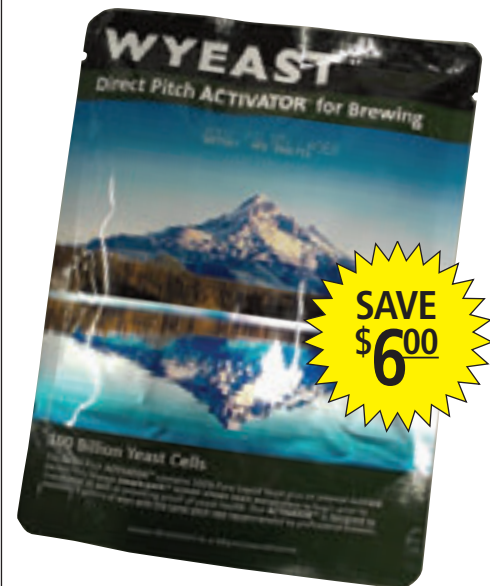
WYEAST Brewers Yeast

Liquid yeast is the choice for more advanced home brewers. Many styles available