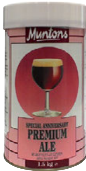
MUNTIONS Canadian Red Ale