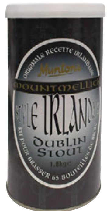
Mountmellick Irish Stout