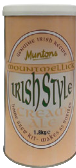
Mountmellick Cream Ale