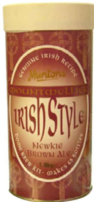
Mountmellick Brown Ale